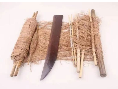
Figure 2 Weaving tools