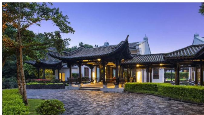
Figure 4 Tengchong Maruyu Valley Banyan Tree

In recent years, the development of hotel architectural design in China has been relatively slow, with little relevant research, incomplete relevant books and materials, and a lack of systematic research on the interior and exterior design of themed hotels. Through the Zhěnglǐ of research materials, it can be seen that most of the current research on hotel design in China focuses on hotel design examples and specifications. Professor Wang Yi, in his book "Hotels and Hotel Design," introduces the basic concepts and development status of hotels from his own perspective and, based on his own practice, proposes some highly insightful design ideas and methods. Chen Jianqiu and Wang Jian, in "Hotel Architectural Design Guidelines," summarize the practice of Tongji Design Institute in hotel construction specialization and, using relevant theoretical and research methods, summarize the planning, design, functional facilities, electromechanical equipment, and technical means of hotels. Zhou Bangjian, in his book "Analysis of Hotels: Twenty Years of Practice and Reflection," draws on his many years of experience in hotel design to provide an in-depth analysis and discussion of hotel planning, design, construction, operation, and management issues from the perspectives of planning, design, construction, operation, and management. Tengchong Maruyu Valley Banyan Tree (Figure 4) is the latest masterpiece of the "Yunnan Three Heroes" Banyan Tree.