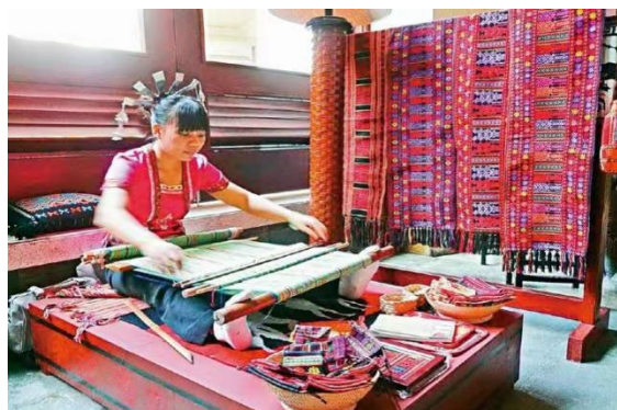
Figure 1 Waist loom