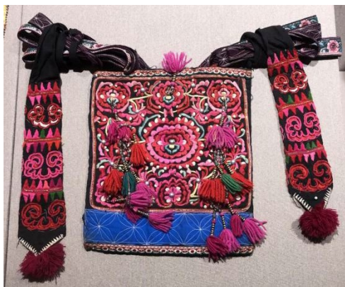
Figure 5 Embroidered Back Felt