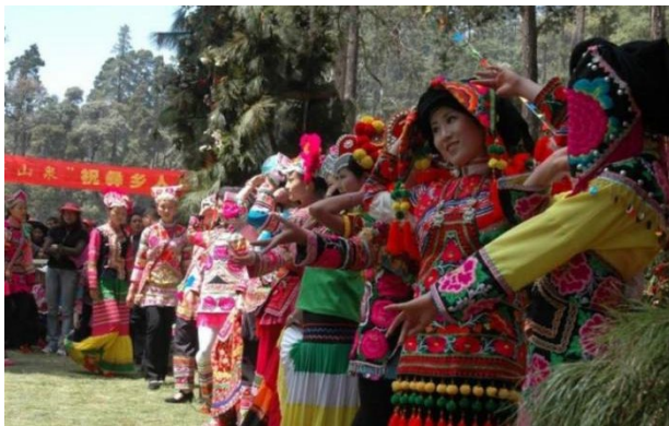
Figure 7 Costumes of the Yi Nationality in Chuxiong

extensive and profound. The main research on the bionic art in Yunnan Yi costumes is based on the beauty of nature to explore the inherent aesthetic laws and cultural connotations of biological forms. The various forms of nature are expressed through various art forms, and its most important features are graphic bionics, shape bionics and image bionics. In the clothing of the Yi nationality in Yunnan, through the continuous combination and change of the eight corners, it symbolizes the eight natural ecological phenomena of heaven, earth, thunder, wind, water, fire, mountain and lake. The Yi people admire fire, and they believe that fire can eliminate all evil spirits and disasters, and will bring good luck to people. Therefore, fire is one of the important elements to build the spiritual culture of the Yi people. At the same time, it also reflects the worship of fire by the Yi people. The clothing patterns of the Yi nationality show the original ecological beauty of nature and their own pursuit of beauty through the artistic expression of graphic bionics.