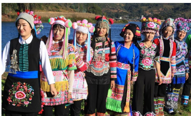
Figure 3 Costumes of the Yi Nationality in Chuxiong

The main colors of the clothing of the Yi people in Yunnan are black, red and yellow. Black is the basic color of clothing of the Yi people in Yunnan. Due to the traditional customs of the Yi people, black is the color commonly used by all branches, and it is also one of the most important colors in clothing colors. The second is red. Red is one of the brightest colors in the clothing of the Yi people in Yunnan. It is mainly used in the decorative patterns of the clothes and is the main color in the embroidery of the Yi people. The decoration techniques of the clothing of the Yi nationality in Yunnan are extremely rich. From the headdress to the shoes, every part shows the charm of red and beautiful, and it is also closely related to the main body of the decorative pattern. Most of the decorative patterns on the clothing are embellished with red, which makes the visual language of the clothing richer and gives people a traditional visual beauty. And yellow is the embellishment color in the decoration colors of the clothing of the Yi nationality in Yunnan. Because most of the Yi costumes are mostly black, and the visual contrast between yellow and black can increase the visual impact and make the whole more beautiful. Although yellow appears in a small area, a part of yellow will appear in each decorative part it is especially important to intersperse among them.