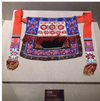
Figure 9 Embroidered belt diagram