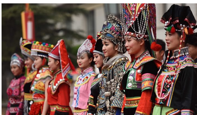
Figure 6 Costumes of the Yi Nationality in Chuxiong