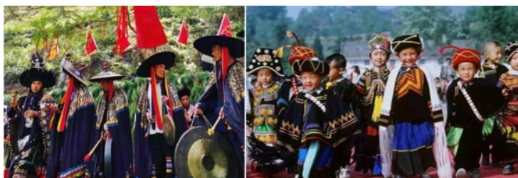
Figure 1 Costumes of the Yi Nationality in Chuxiong

in Yunnan show various cultures in different periods in visual language, summarize, describe, fix materialized forms and sublimate things in the process of change, and summarize, refine and deform things to make them more effective. The aesthetic characteristics of the outstanding image have thus formed a unique clothing culture of the Yi nationality in Yunnan.