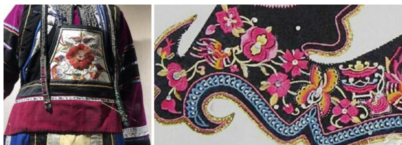
Figure 4 Yunnan Yi ethnic costumes with flower and bird patterns

The living environment is an important basis for artistic development and artistic innovation. The Yi people advocate nature, and with the accumulation of long-term social practice, the clothing of the Yi people in Yunnan has accumulated pattern elements of a wide range of themes, such as birds and beasts, figures, flowers, insects and fish, mountains and rivers, the sun and the moon, etc. The content of the patterns is quite lifelike, and the images are vivid and lifelike, and most of the patterns about animals still retain the traces of the original totems of the Yi people. While decorating the clothing of the Yi people in Yunnan, they also beautify life. In terms of form expression, the traditional Chinese line drawing method is mainly used to outline the decorative pattern with a single line as the basic method, focusing on the main features of the theme shape, and using artistic techniques such as exaggeration, abstraction, and deformation to turn it into a painting with artistic value. Decorative pattern.