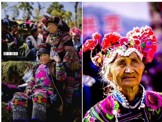
Figure 2 Costumes of the Yi Nationality in Chuxiong